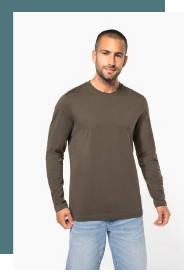
All rights reserved ©