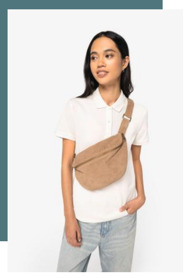
All rights reserved ©