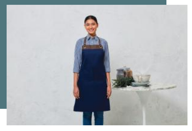
All rights reserved ©