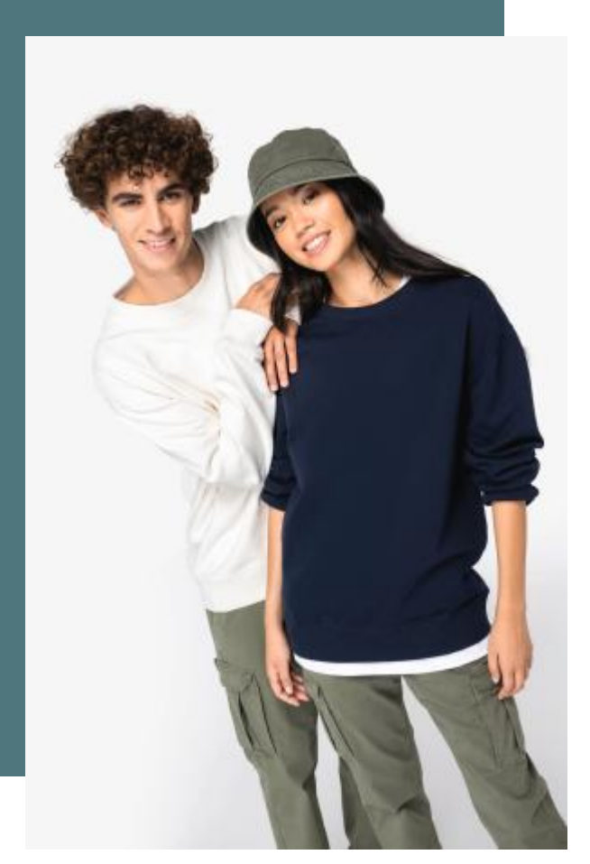
All rights reserved ©