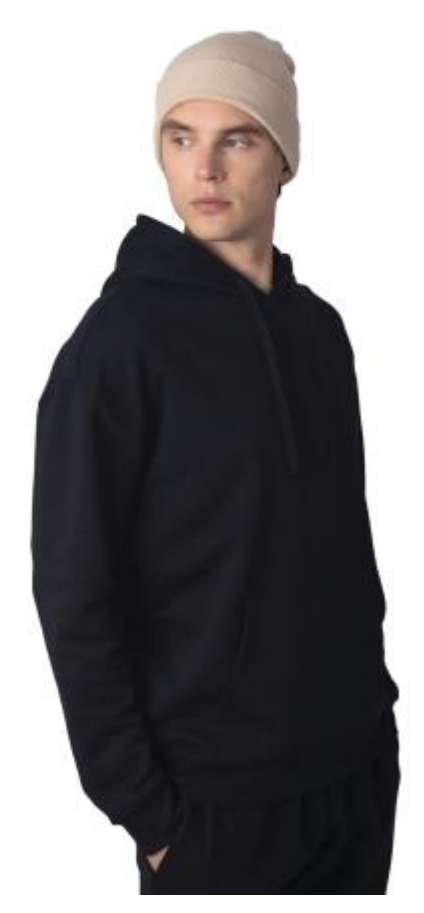
All rights reserved ©