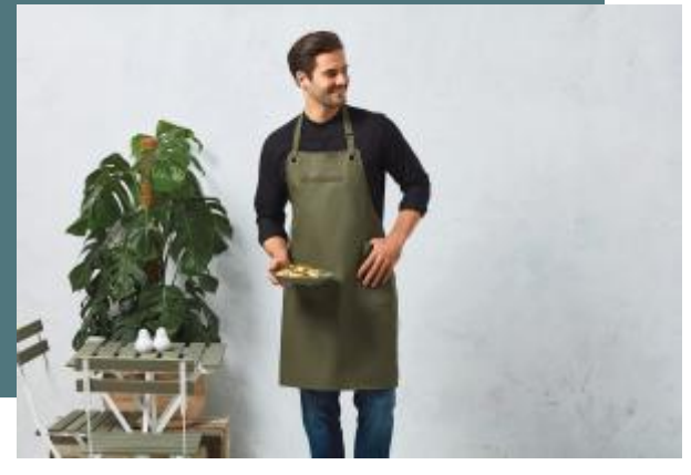
All rights reserved ©