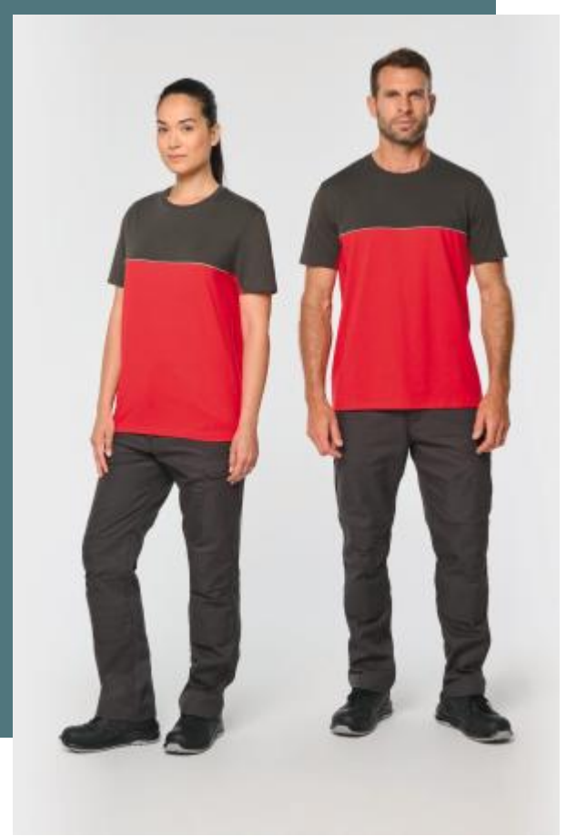
All rights reserved ©