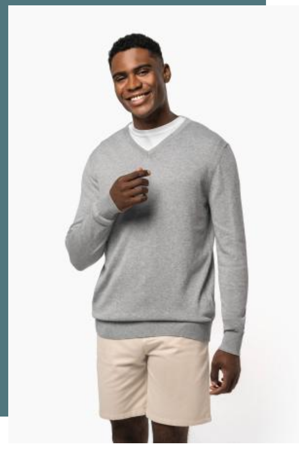
All rights reserved ©