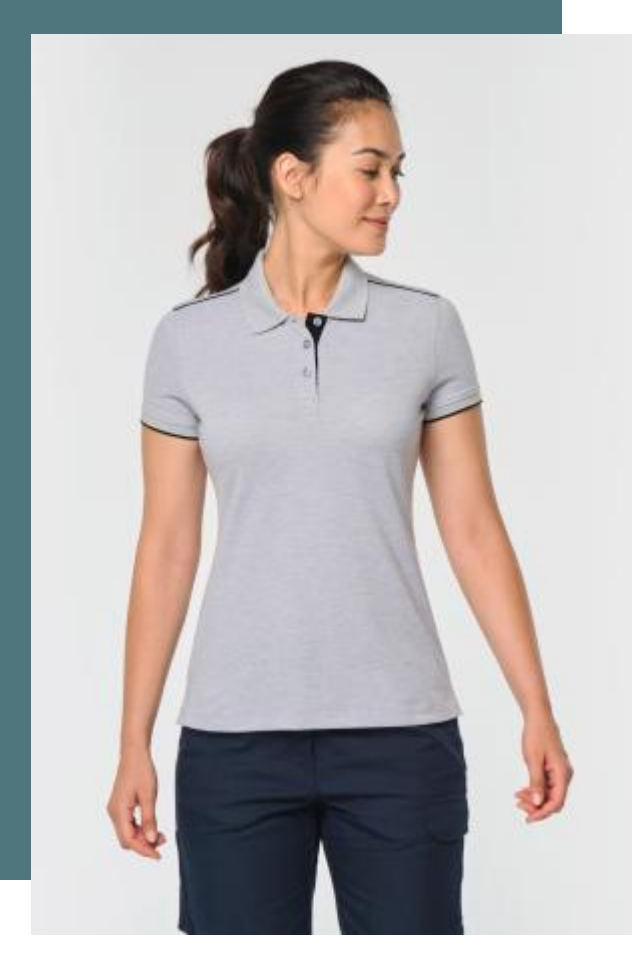
All rights reserved ©