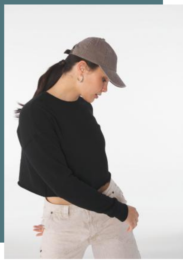
All rights reserved ©