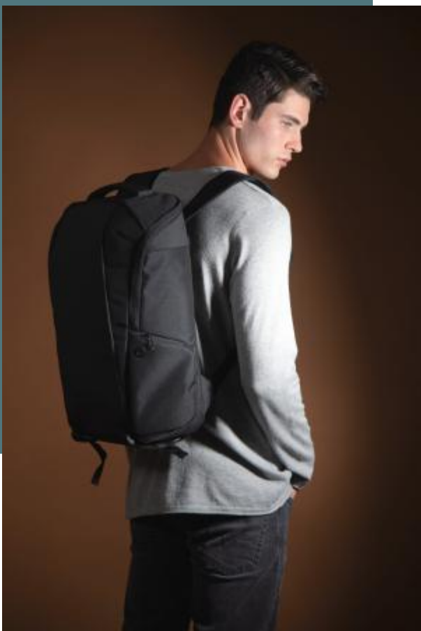
All rights reserved ©