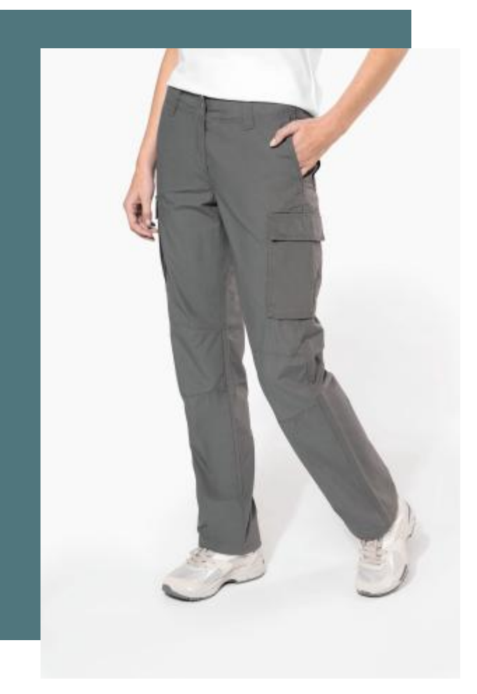
All rights reserved ©