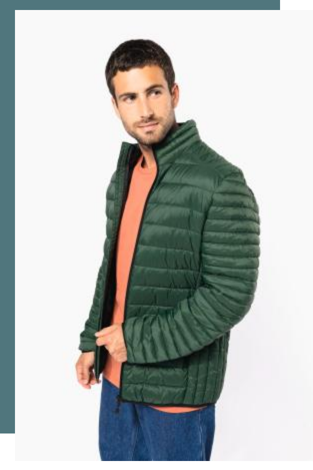
All rights reserved ©