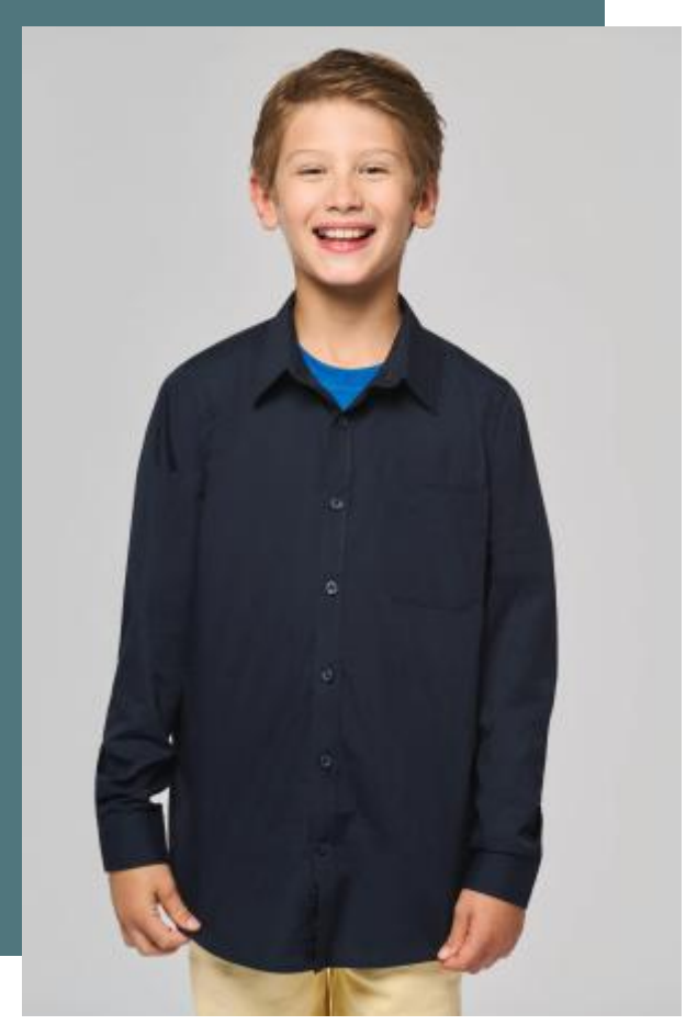
All rights reserved ©